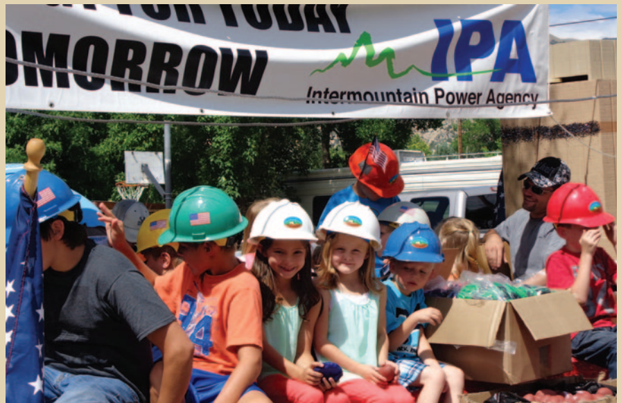
Photo: Children of Intermountain Power Service Corporation employees supplied the manpower for the Project’s float appearances in community parades this summer.

The float – staffed by children of employees – appeared in parades in Hinckley, Delta, and at the highly popular Ute Stampede in Nephi. “Renew IPP” footballs and Frisbees were “distributed” to parade-goers from the float.